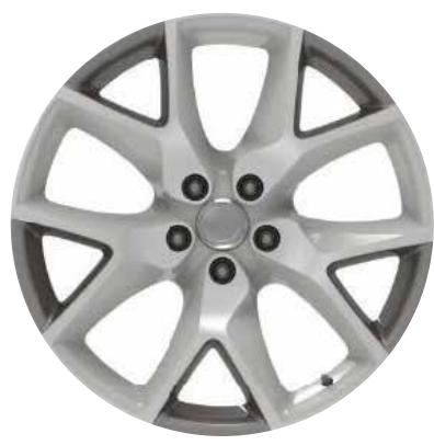
22" Dune Twist