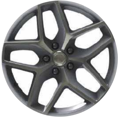
21" Cascade Dusk