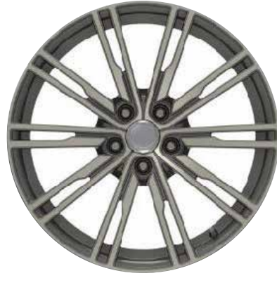
22" Forged Spur