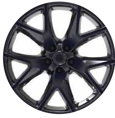
22" Fused Black Onyx