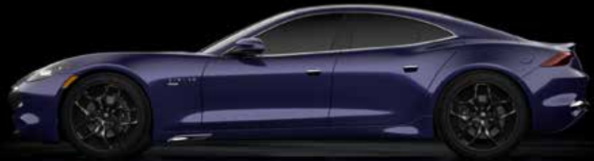
Bodega Bay Blue