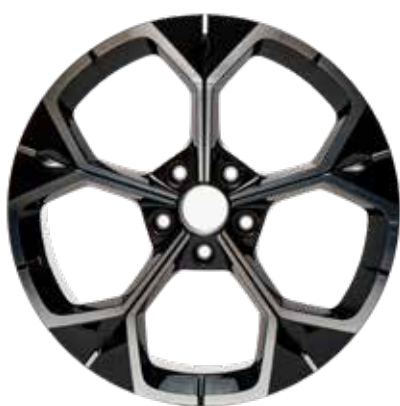
21" Racer's Edge