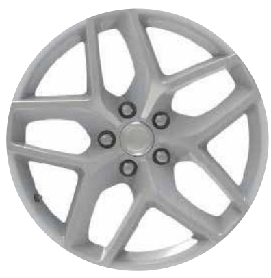
21" Cascade Silver