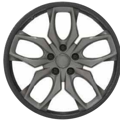
22" Carbon Shadow