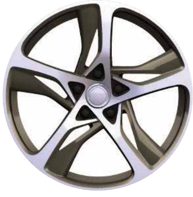
21" Twin Forged